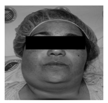
Figure 1. Swelling of the right parotid gland

Anethesia mumps are transient and may last for several minutes to several days. The majority of cases were found after the patient underwent anesthesia for a long time (2). In our patient was seen after 24 hours of surgery. Anesthesia mumps are usually regarded as a mild and transitory complication. Patients may complain light pain and distress, but airway patency is not threaten, nor are reflexes like swallowing or caughing impaired. But acute salivary gland swelling during anesthesia induction led to airway obstruction and tracheostomy (5). In our patient complained of moderate bilateral swelling and mild pain in this area. There were mild difficulty of swallowing, and mild dyspnea. Anesthesia mumps is a rare and selflimited postoperative complication, which usually subsides within a few days with symptomatic therapy including antiinflammatory drugs, adequate hydration, and observation. In our patient was administerd non-steroidal anti-inflammatory drug two days and no antibiotic was given. Her clinical symptoms and signs improved for 3 days postoperative.